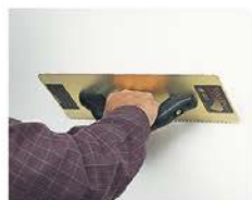
Shaves High Spots