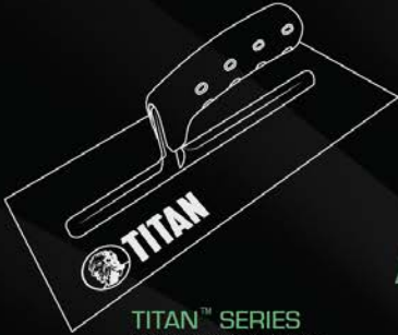
TITAN™ SERIES MASONRY TROWEL