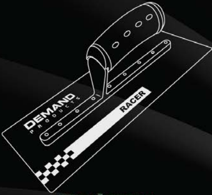
RACER™ ORIGINAL EIFS STUCCO TROWELS