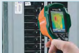
Detect hidden problems fast