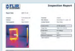
QuickReport™ PC software enables user to analyze Temperature of all JPEG images from microSD card