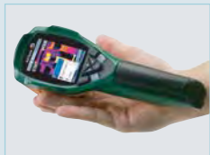
Pocket sized and extremely lightweight—only 12 ounces