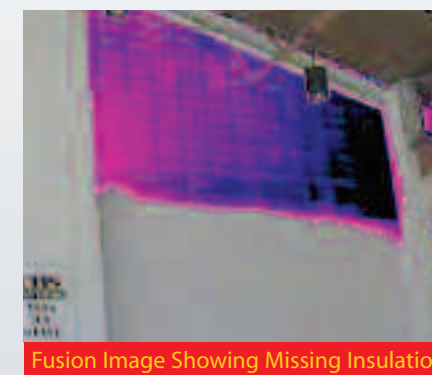
Fusion Image Showing Missing Insulation