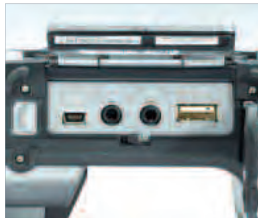
From Left to right: USB mini for PC image download, 4 pole audio for voice annotation, NTSC video, USB-A for memory stick image transfer